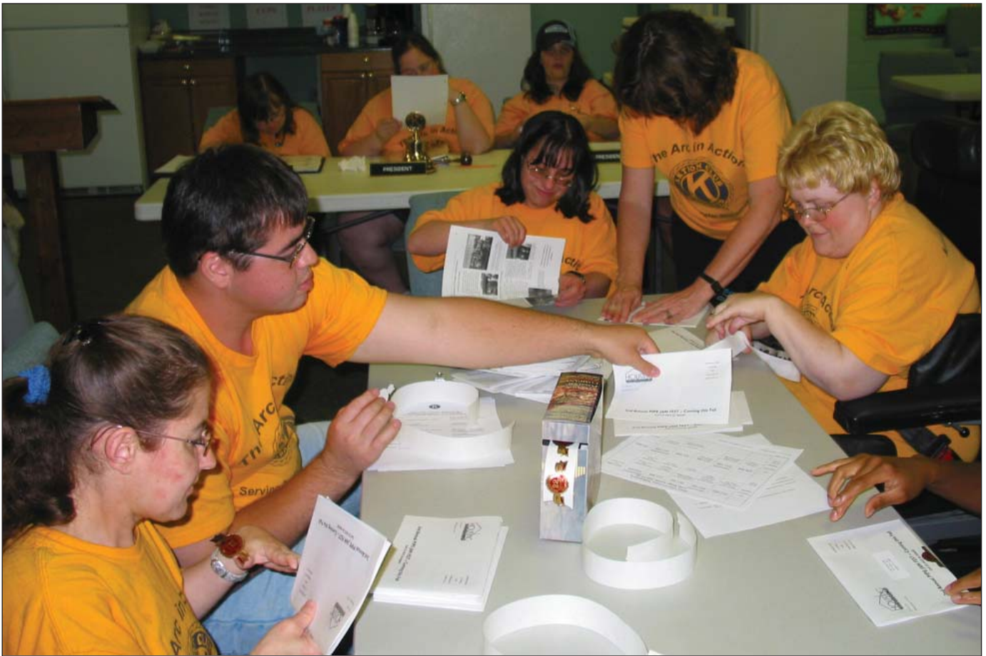
The July service project for the Aktion Club was to help the local Housing Partnerships organization. Aktion Club members and several volunteers folded, labeled, sealed, and sorted over 200 Housing Partnerships newsletters to get out the word about the work done by the organization repairing and replacing substandard housing in the greater Williamsburg area. The Aktion Club is a jointly sponsored club of the Williamsburg Kiwanis and the Arc of Greater Williamsburg.